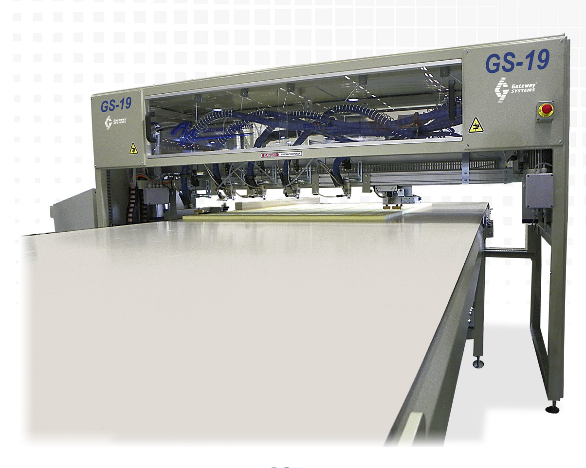
GS-19 Hot-Melt Glue Line

Glue line series from Gateway® Systems provides an ergonomic solution to assembling mattress units.